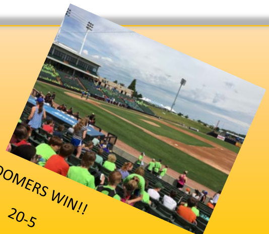
BOOMERS WIN!! 20-5