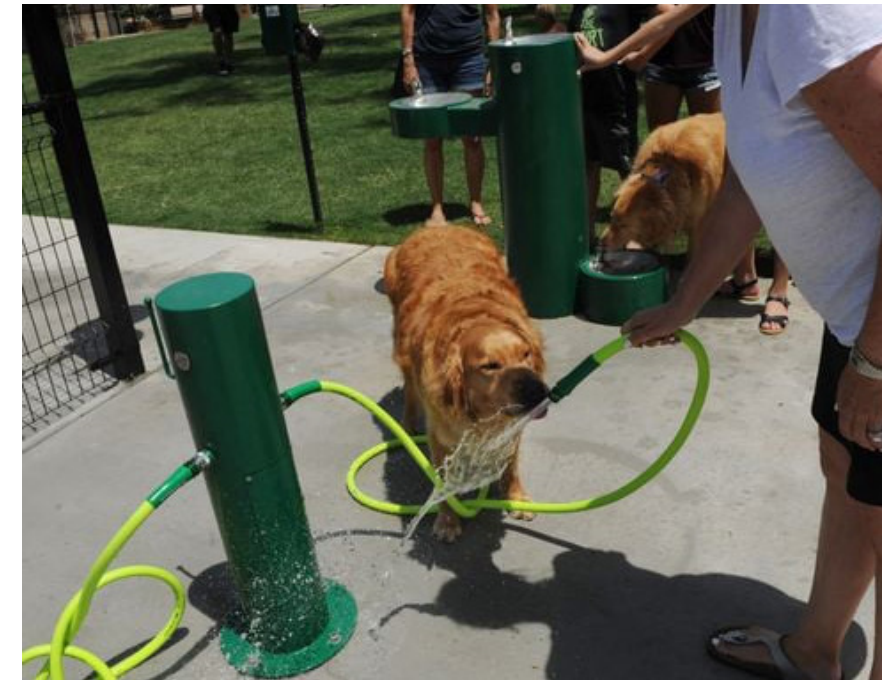
DOG WASHING STATION