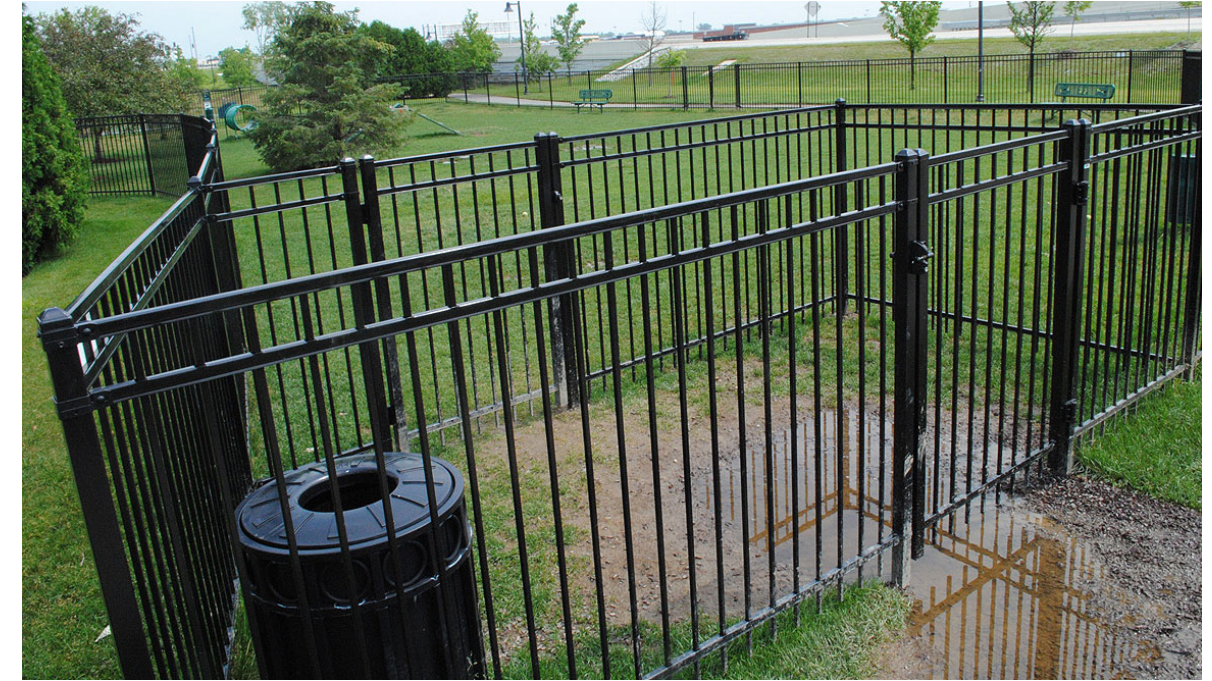
METAL PICKET FENCE AT SECURE ENTRANCE