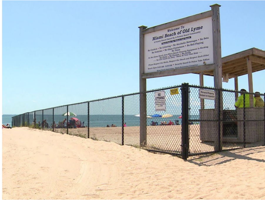
BLACK VINYL COATED CHAINLINK FENCE