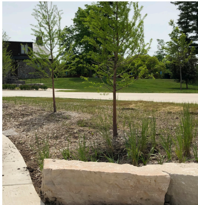
OUTCROPPING STONE SEATS