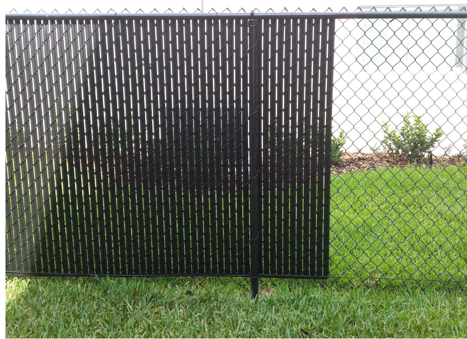
BLACK VINYL COATED CHAINLINK FENCE WITH SOLITUBE SLATS