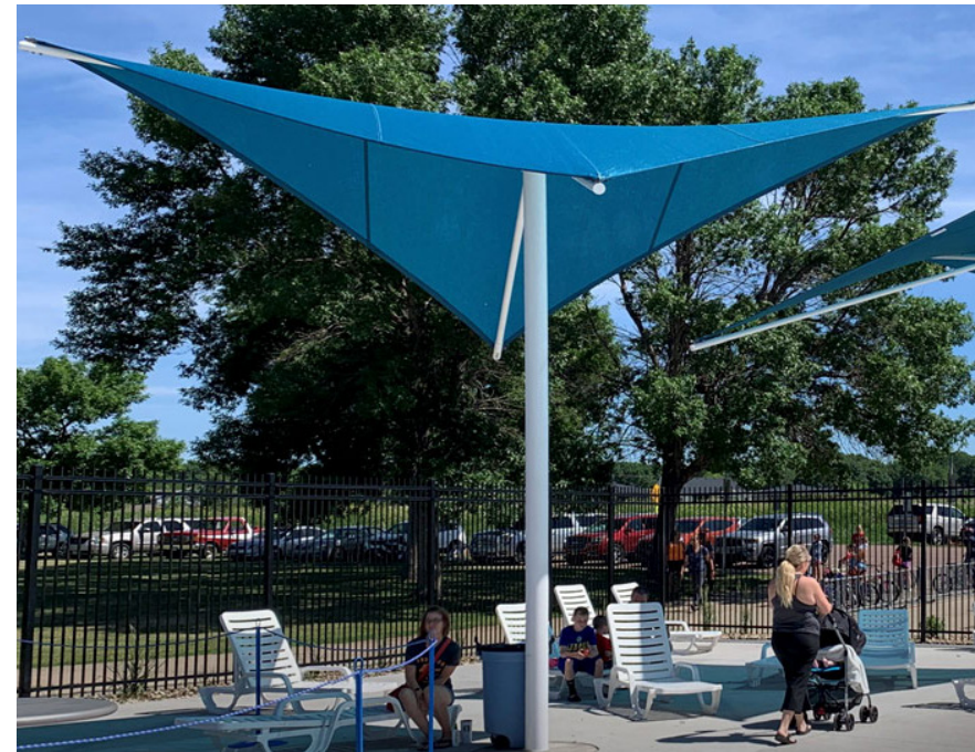
SINGLE POST SHADE SAIL