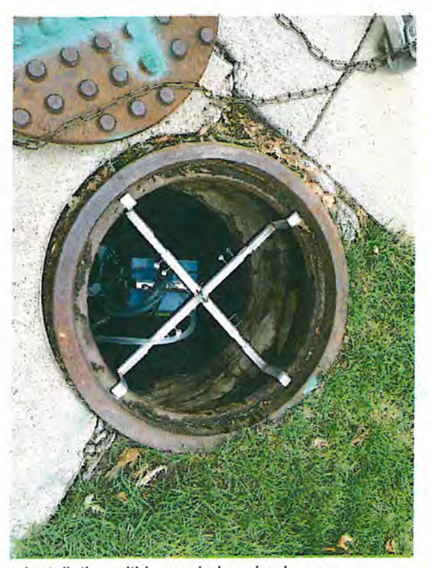
Installation within manhole using hanger.