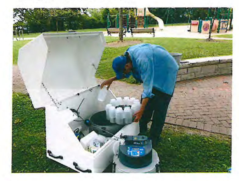
Automatic sampler within fiberglass enclosure