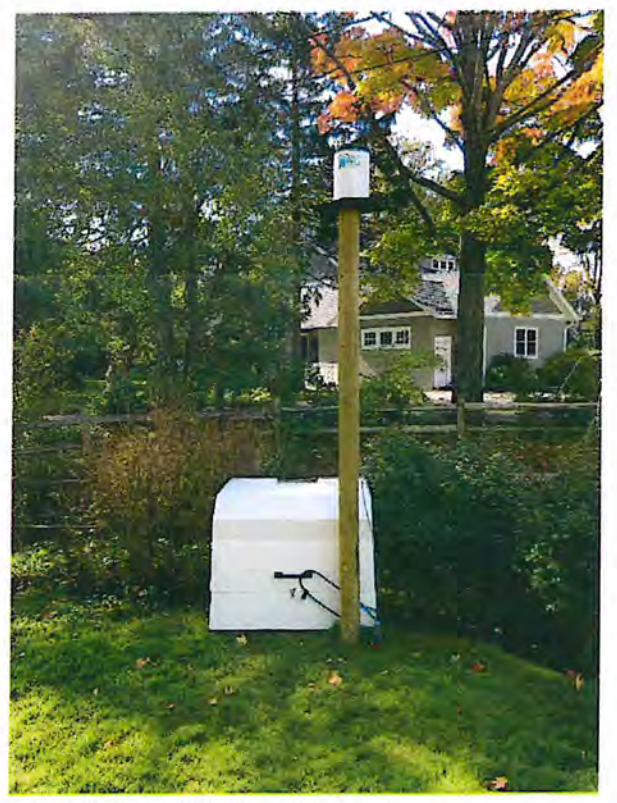
Installation within fiberglass enclosure. Rain gauge mounted on 4x4 post.